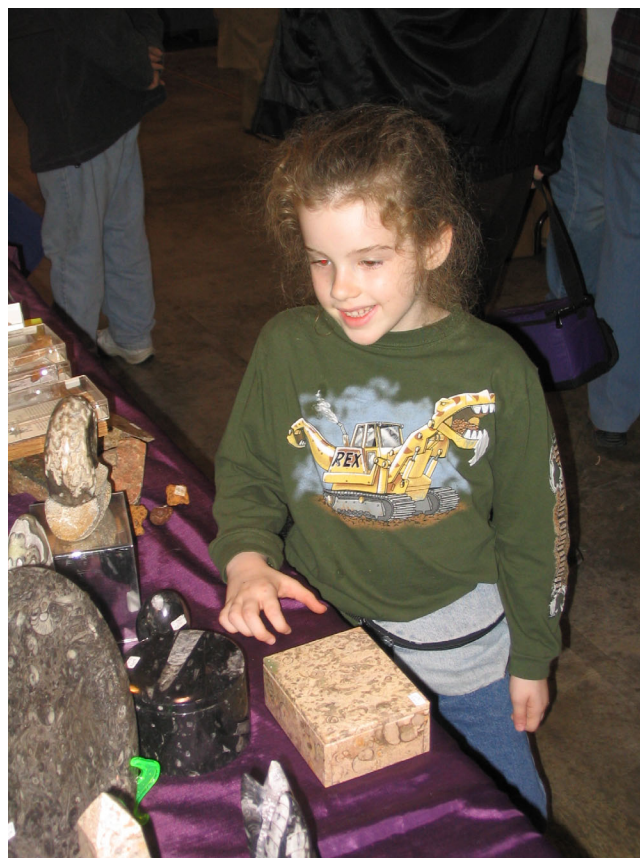
Fest visitor, with cool sweatshirt.