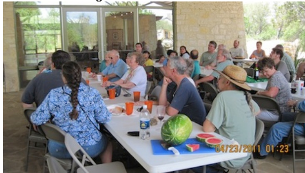
A good turn out.