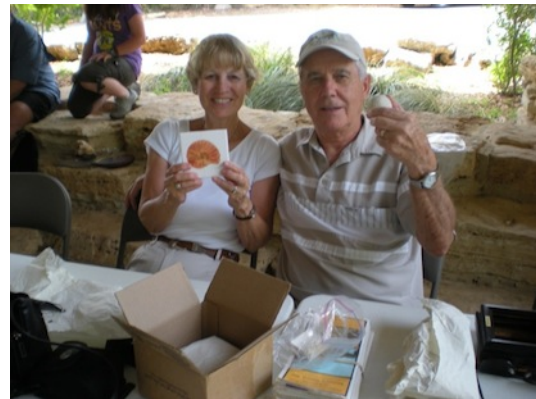
Good stuff to bid on.