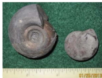
Nautiloids from the area