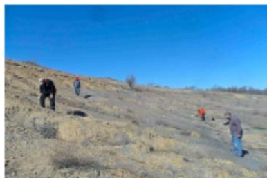
Collecting at Lake Jacksboro