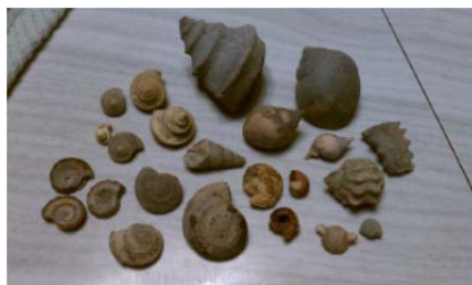
Typical Finis Shale fossils