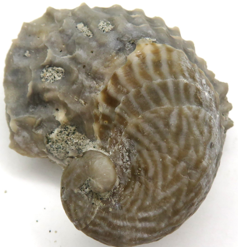
Fig. 3 Exogyra tigrena (Jamie Shelton)

But the Exogyra tigrenas are the treasure of this spot.... beautiful oysters with a stripey pattern still visible. (Fig. 3) This site is the only one that I know of that has these special oysters. Some were easily extracted and some needed a bit of “encouragement” (rock hammer to the rescue)! After a lot of fun hammering and a few more explorations, we decided to head back as a group. A few more nice little fossils were found along the way – a decent Trigonia thoracia and few more good oysters. All in all, while there might not have been a lot of finds, It was a lovely day for a little bit of winter fossil hunting!