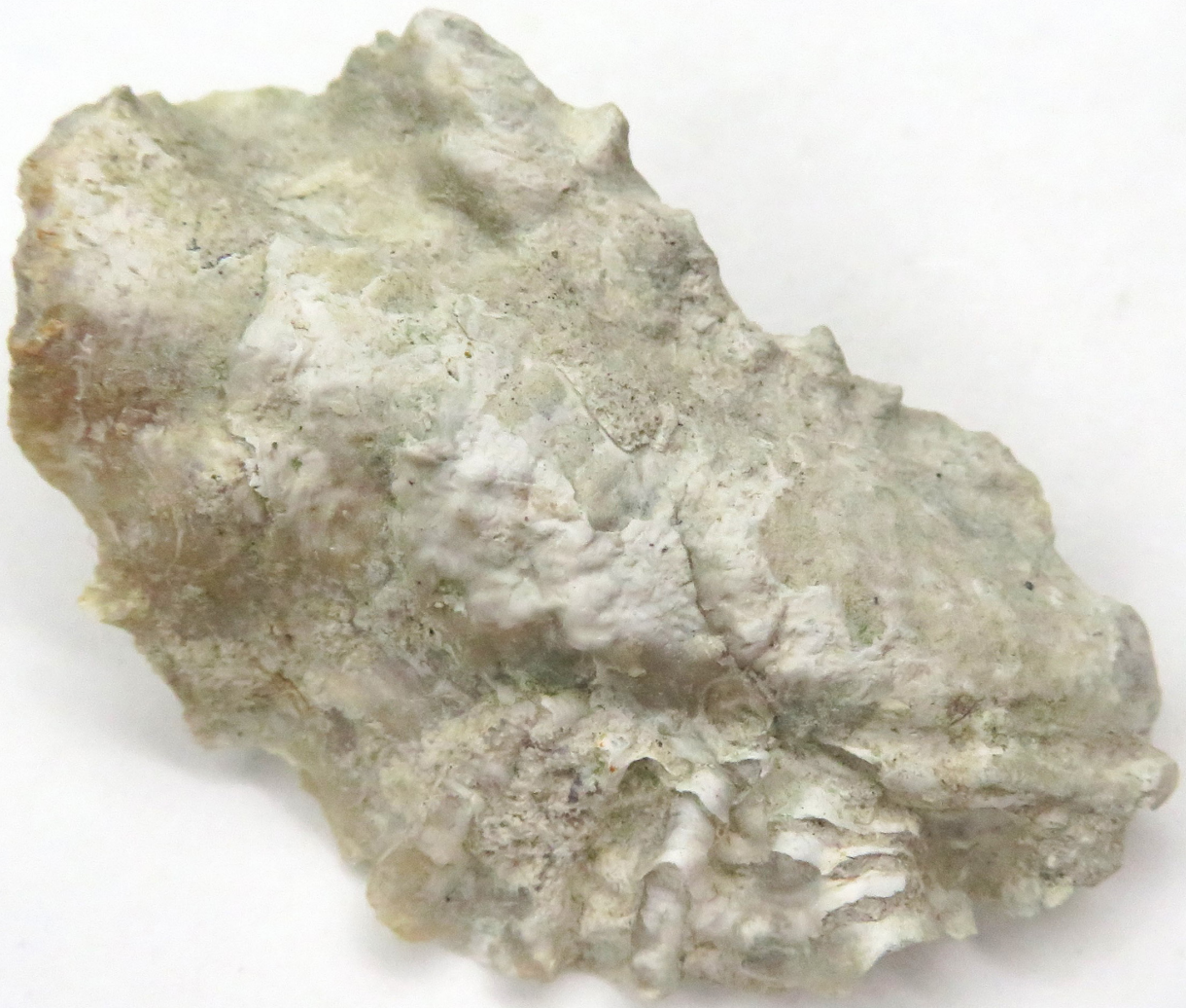
Fig. 2 Lophopoda panda (Jamie Shelton)

We hiked up a ways past the bridge to get to some better hunting grounds, finding a few nice things along the way. Ed and I both scored small nautiloids and Ed gifted me a lovely Lophopoda panda (fig. 2) which are very small thin oysters found in the Dessau Formation (I believe!). As we got further upstream, we found a VERY large ammonite (in situ) that we all got to take pictures of, but it was definitely a “leaverite” (“leave it right” there - Fig. 1) If we had tried to get it out, it would have destroyed it. A few other ammonite pieces were found, but nothing whole, sadly.